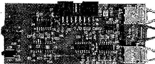
F/O Daughter Board