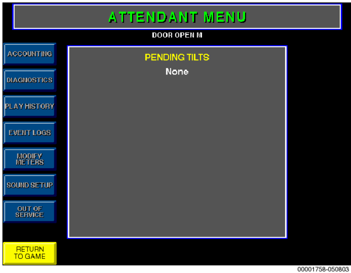
Figure 1-1. Attendant Menu

Figure 1-1 shows the main Attendant Menu screen, and Figure 1-2 shows the main Operator Menu screen.