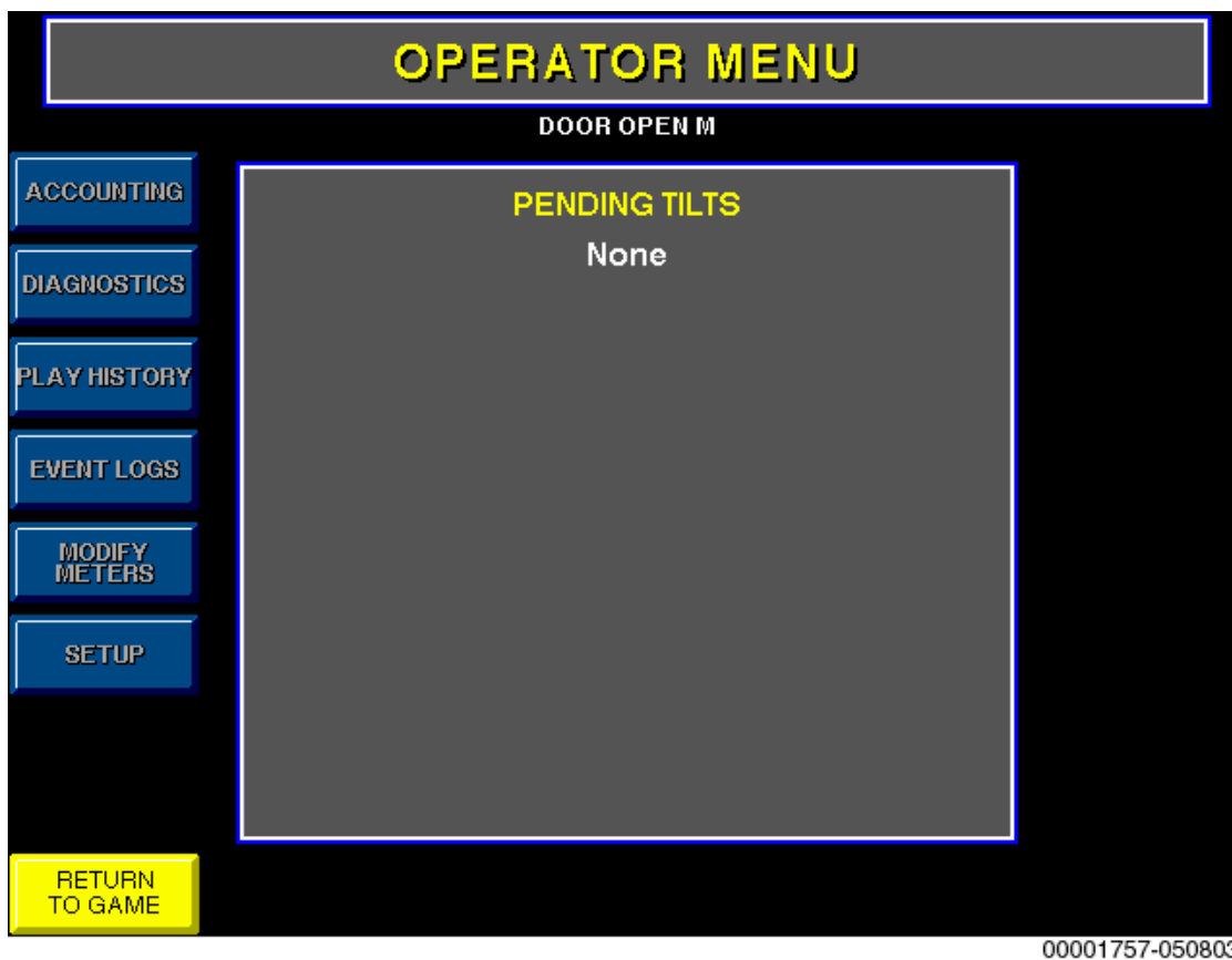
Figure 1-2. Operator Menu